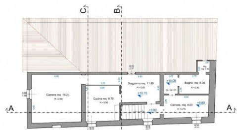
PIANO PRIMO da Via Adua